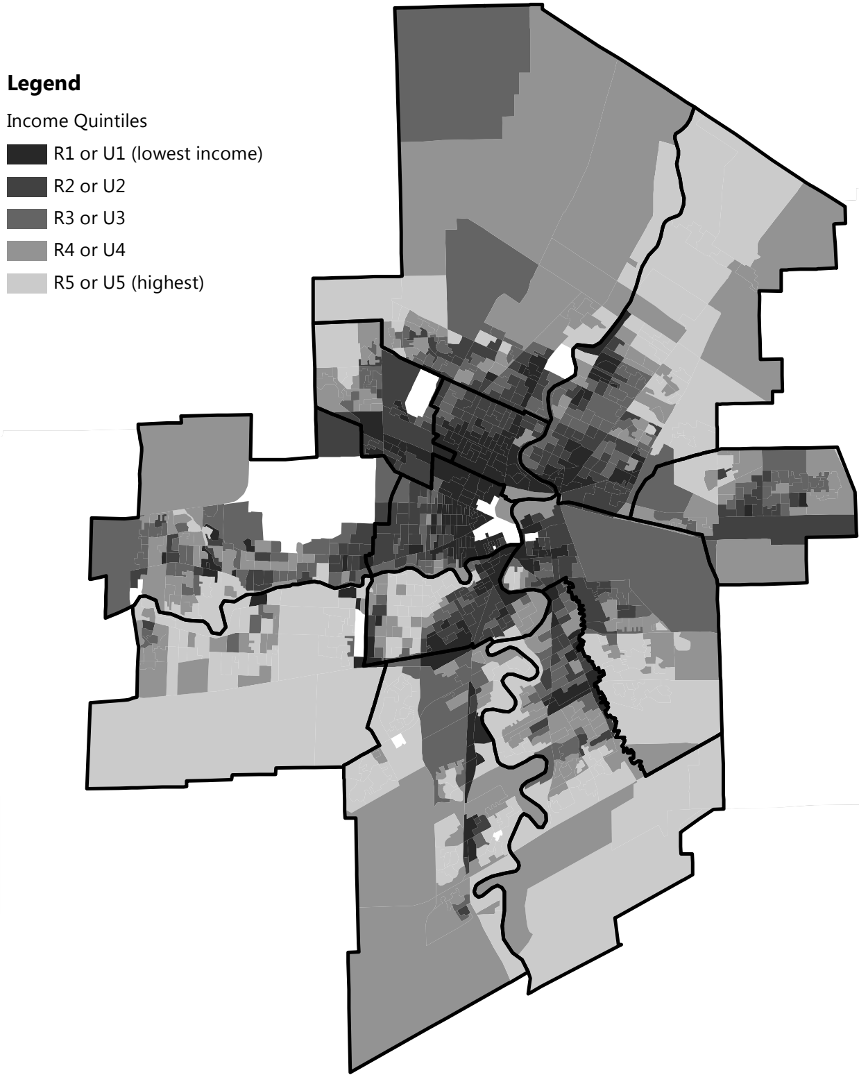
Figure 1.5: Distribution of Urban Income Quintiles in Winnipeg, 2006 Census Data Dissemination Areas Quintile breaks are at different points in Winnipeg

Charles Burchill, Manitoba Centre for Health Policy. January 2009 Based on 20% Population groups of Average Household Income by Census Dissemination Areas. Census of Canada 2006.