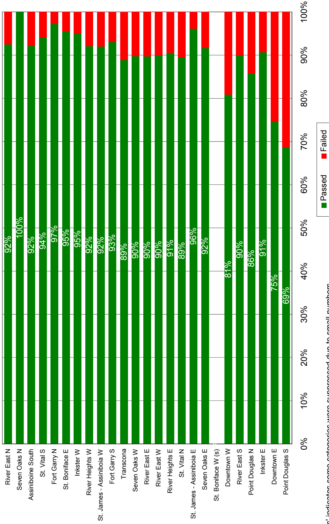
Left Side of Graph: Grade 3 Language Arts Standards Test Performance by Winnipeg NC, Pass/Fail of test writers, 1998/99

's' indicates some categories were suppressed due to small numbers