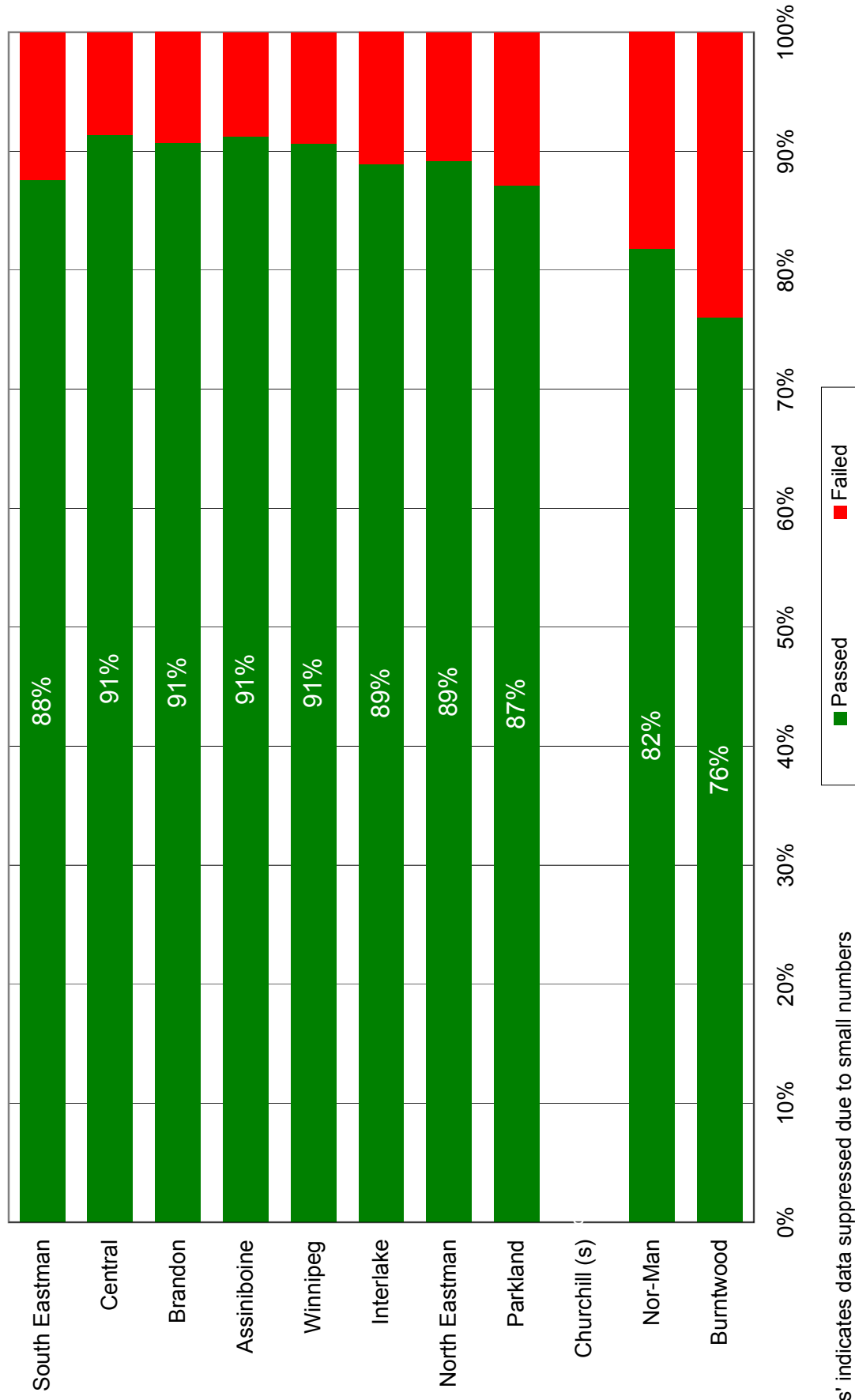
Left Side of Graph: Grade 3 Language Arts Standards Test Performance by Manitoba RHA, Pass/Fail of test writers, 1998/99

's' indicates data suppressed due to small numbers