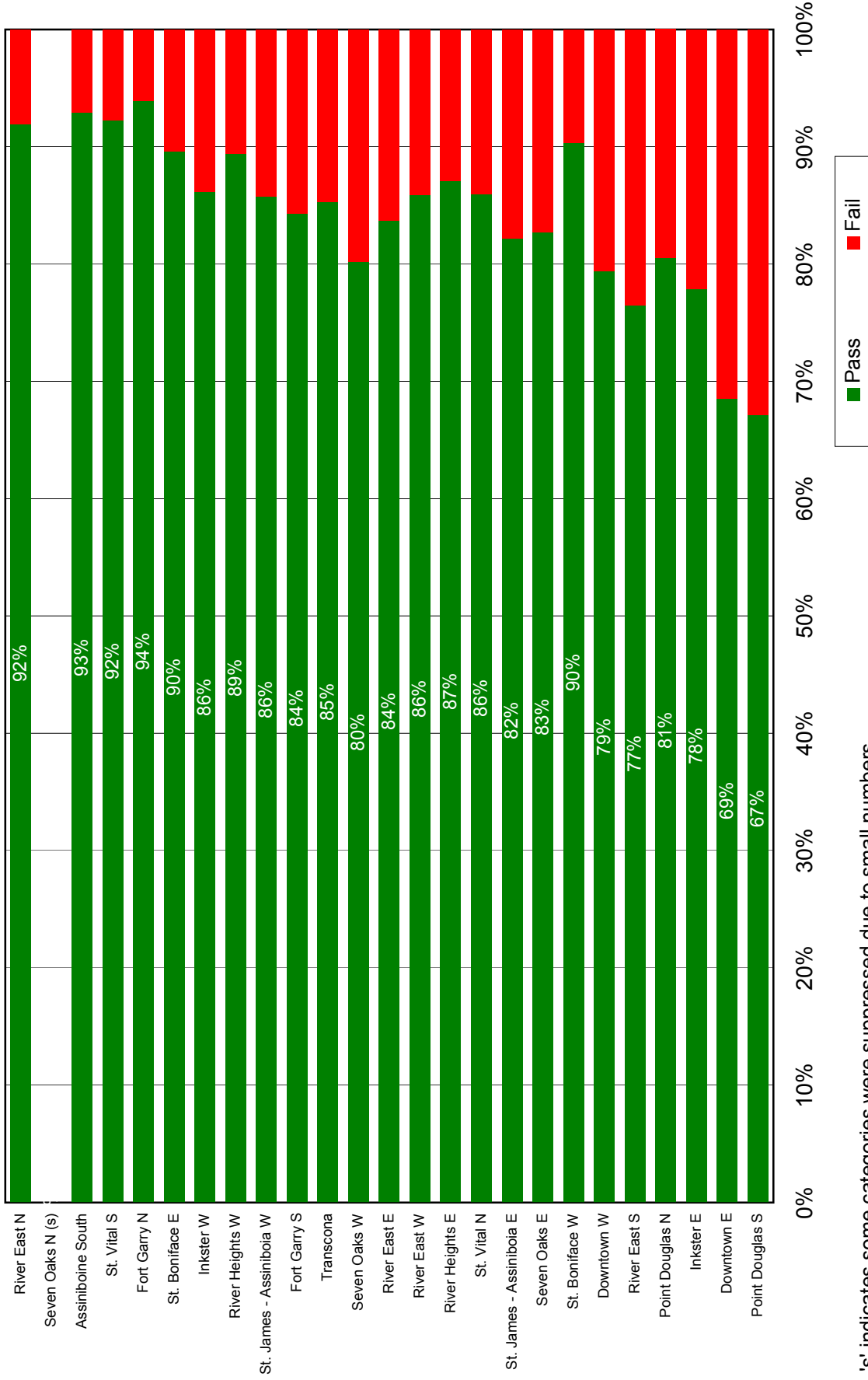
Left Side of Graph: Grade 12 (S4) Language Arts Standards Test Performance, by Winnipeg NC, Pass/Fail rates of test writers, 2001/02

's' indicates some categories were suppressed due to small numbers