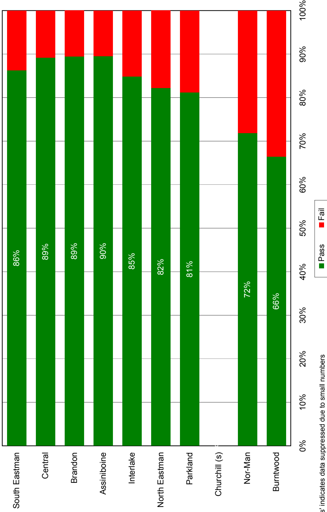
Left side of graph: Grade 12 (S4) Language Arts Standards Test Performance by Manitoba RHA, Pass/Fail rates of test writers, 2001/02

's' indicates data suppressed due to small numbers